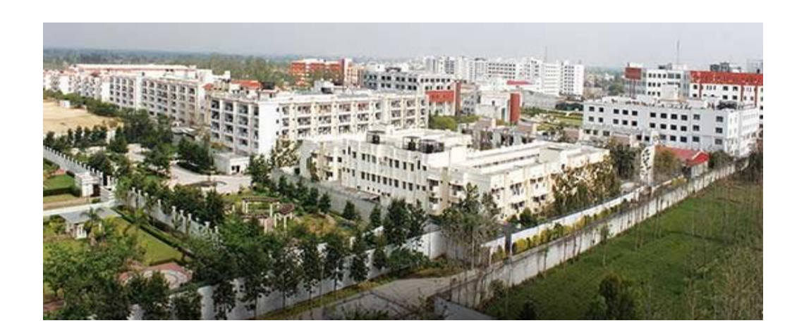
Teerthanker Mahaveer University Campus

partnerships. ISO certification and NABL Certification further validate its operational and academic standards. As a proud member of UNAI (United Nations Academic Impact), the university is globally connected in advancing educational goals. Awarded Gold band status as an Institution of Prominence in OBE Rankings 2023, and positioned in the prestigious band of 51-100 in the Innovation category of NIRF India rankings 2023, it continues to lead through innovation and academic distinction. Achieving Grade A with Gold Category in Sustainable Institutions of India Green Rankings 2023 further underscores its commitment to sustainability. Rank 11 among India's Top Private Universities for Medicine and Allied Courses and Teerthanker Mahaveer College of Pharmacy securing Rank 4 in Uttar Pradesh by IIRF are testament to its exceptional contributions to the field of healthcare education and research.