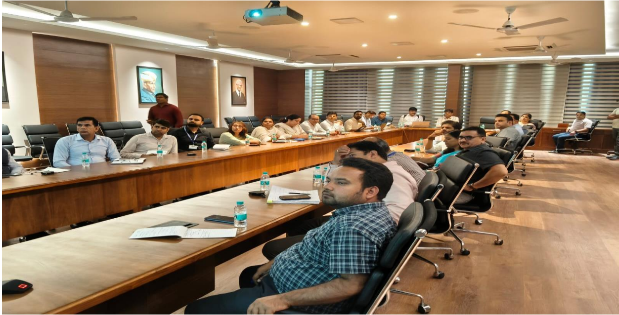
(Discussion During IQAC Meeting)

Accredited with NAAC A Grade 12-B Status from UGC