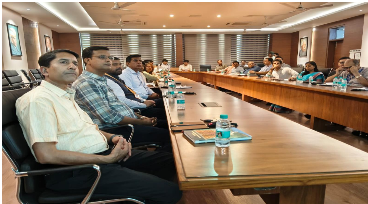
(IQAC Meeting Group Photograph)

The 24 th IQAC Meeting concluded with the assurance to complete all the tasks in a given time period in compliance with the institutional benchmarks. The meeting concluded with a vote of thanks delivered by the Director, IQAC.